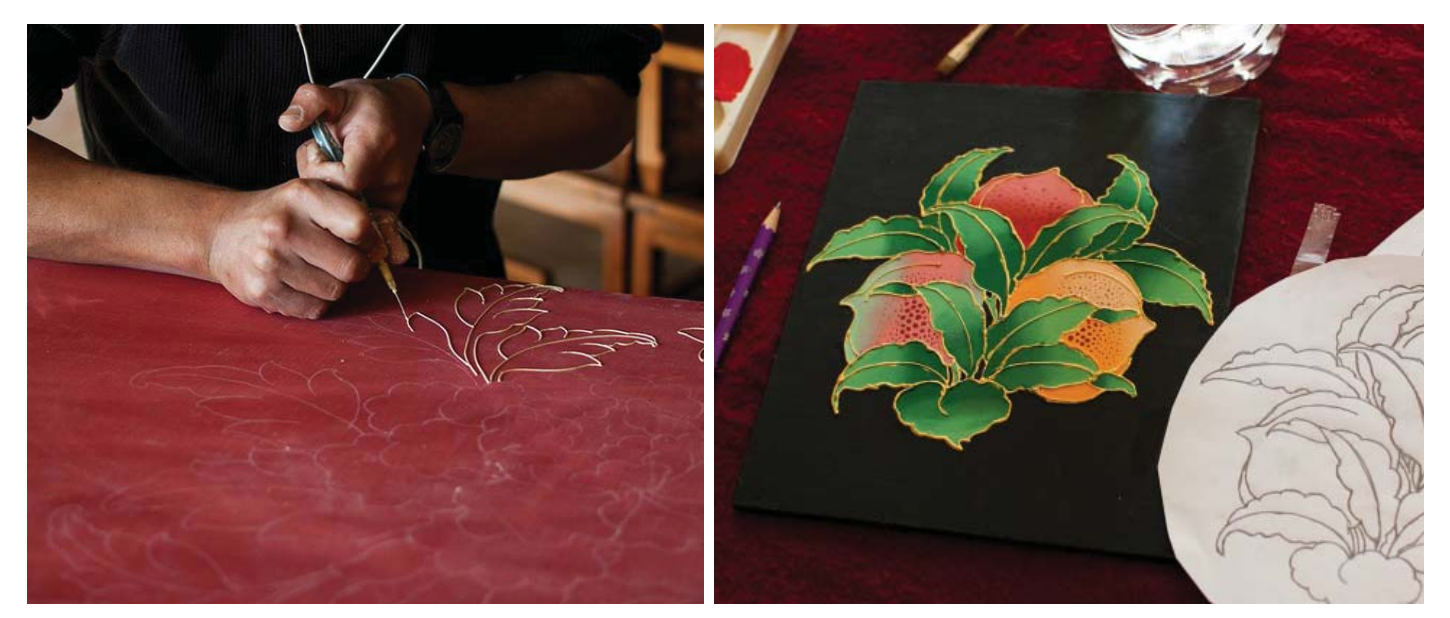
Below is the basic curriculum of the wood painting workshop, although, the actual time it takes to complete each task will depend on the student. It is not necessary to have any prior experience.

This is a very popular workshop and is loved by children. We can also adapt the workshop to make it suitable for children as young as 6 years.